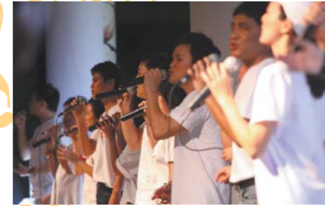
Driven To Perform... p.L.a.Y! performs to an audience of thousands at the Marina Bay Golf Course driving range.

As a part of Young NTUC, p.L.a.Y! has done more than just entertain audiences, they have revived a sense of interest in youths about the Labour Movement and will continue to do so with their unfailing positivity and dedication to the stage.