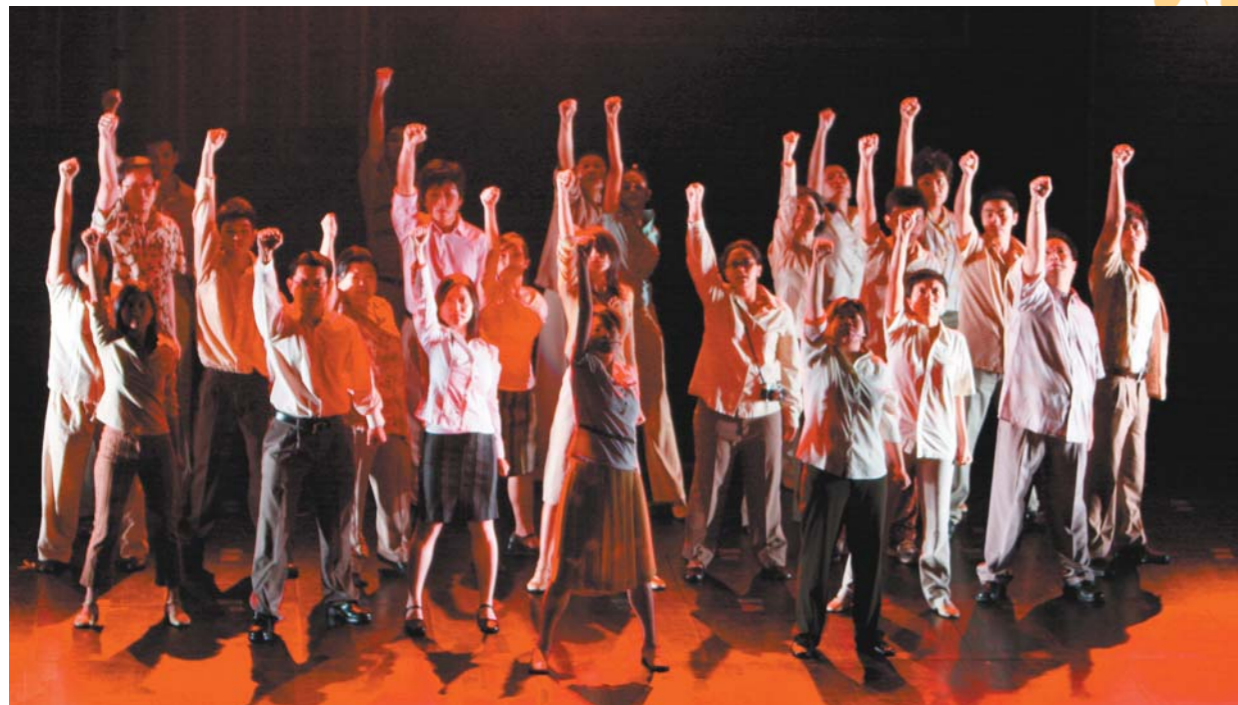
A Musical Extravaganza...The story behind the NTUC fashioned into a musical.