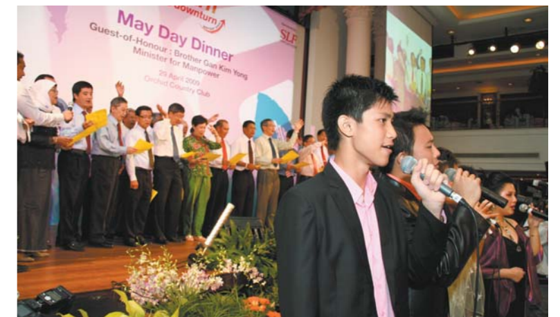
Night To Remember... Singing 'Solidarity Forever'.