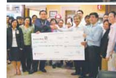
A Healthy Boost... HSEU union leaders are all smiles with the generous donation from NUH, CGH and TTSH.

"NUH management and the union have always enjoyed an established and strong partnership with a common belief in the welfare of union members. We therefore support NTUC's initiative to assist workers and their families who are affected by the current economic downturn. We hope that this $5,000 contribution to the U Care Fund can provide some financial assistance to affected workers and their families."